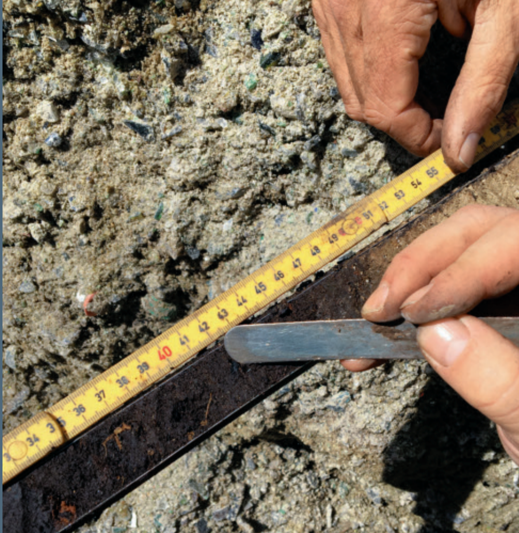
Afrensning af boreprøve fra karteringsbor.