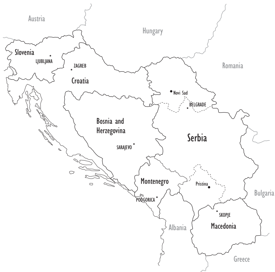
Former Yugoslav republics and autonomous provinces, 1945-1991