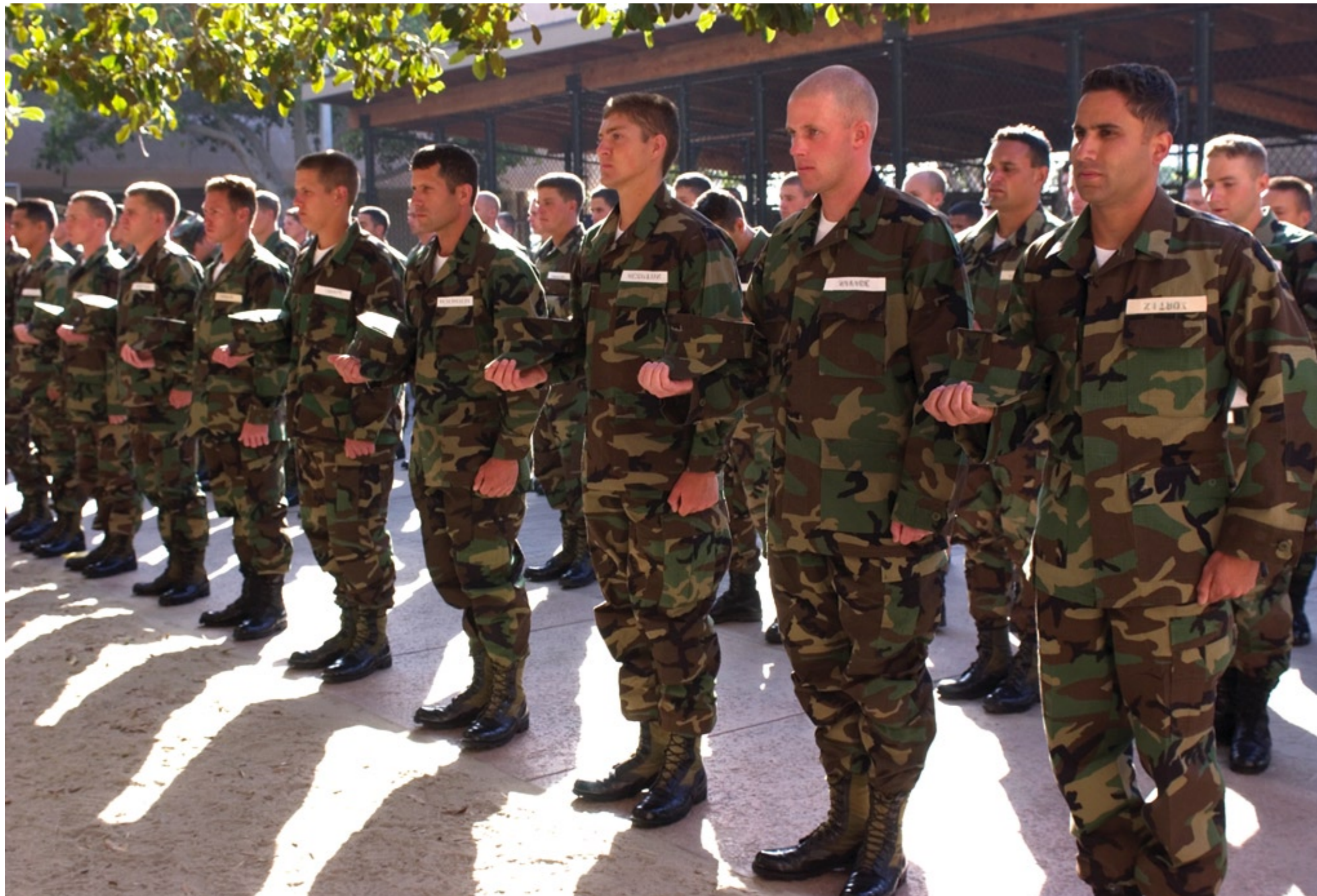
The first day of Indoc begins with a personnel and barracks inspection.