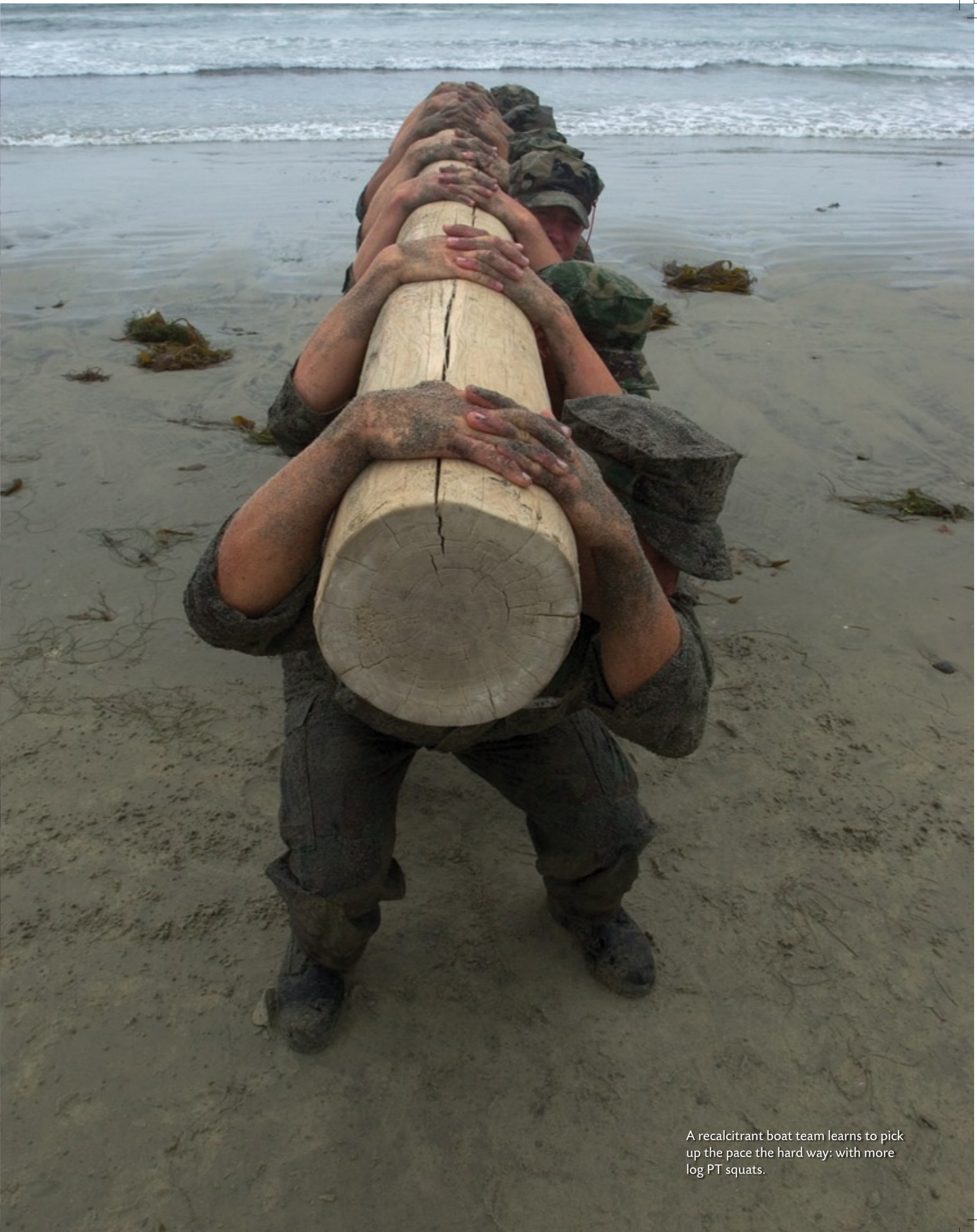
A recalcitrant boat team learns to pick up the pace the hard way: with more log PT squats.