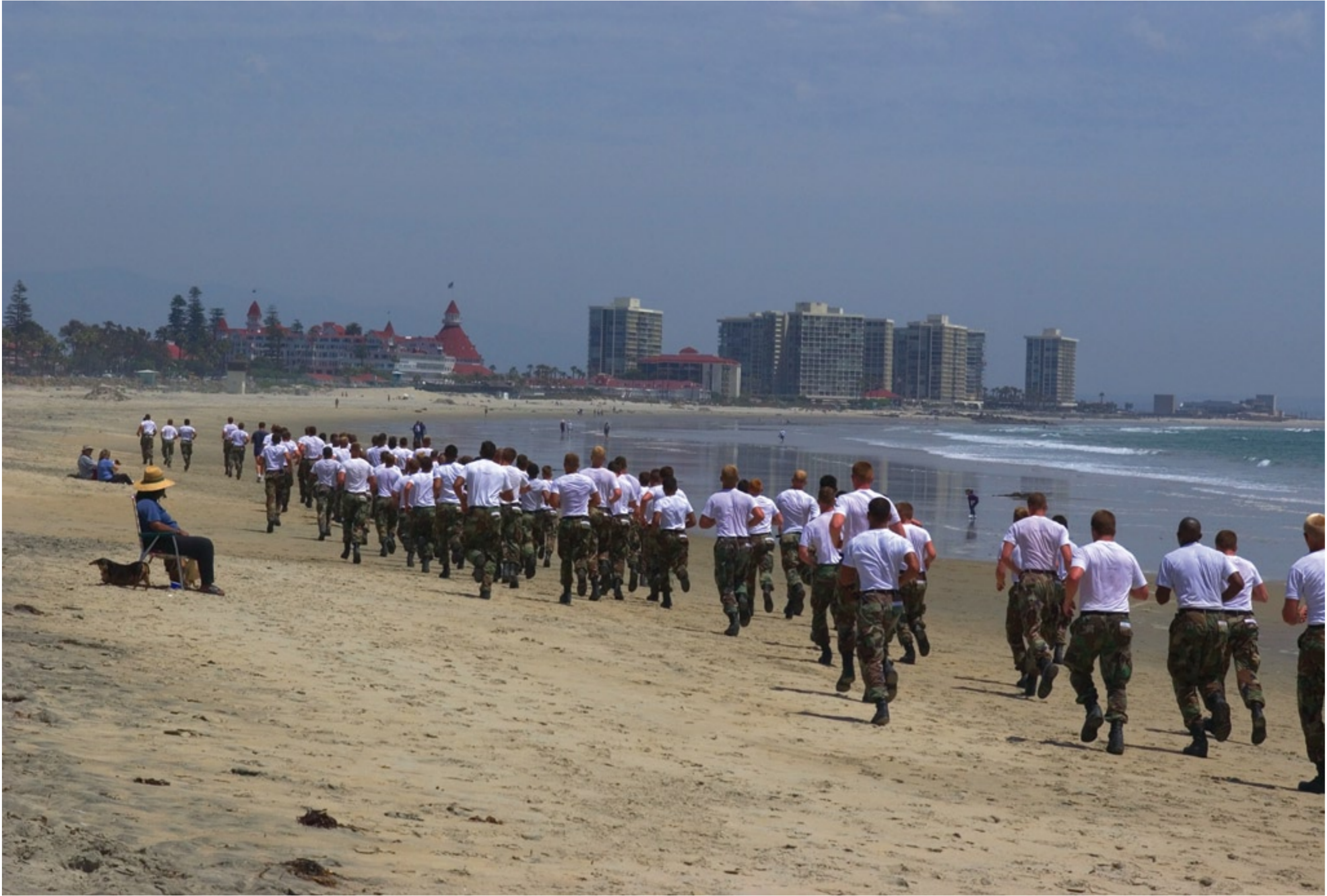
Students log miles on an Indoc conditioning run from the Naval Special Warfare Center to the Hotel Del Coronado and back. Along the way they pass idle sunbathers, tourists, and surfers enjoying a warm day of recreation at the beach.