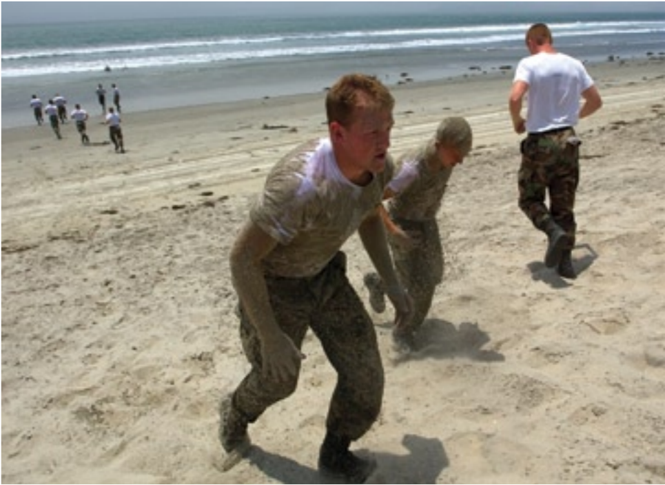
Let the chafing begin! Sand manages to infiltrate every nook and cranny of students' bodies by First Phase. Several weeks into training, the sticky, wet granules will have rubbed the men raw in the most intimate, uncomfortable places.