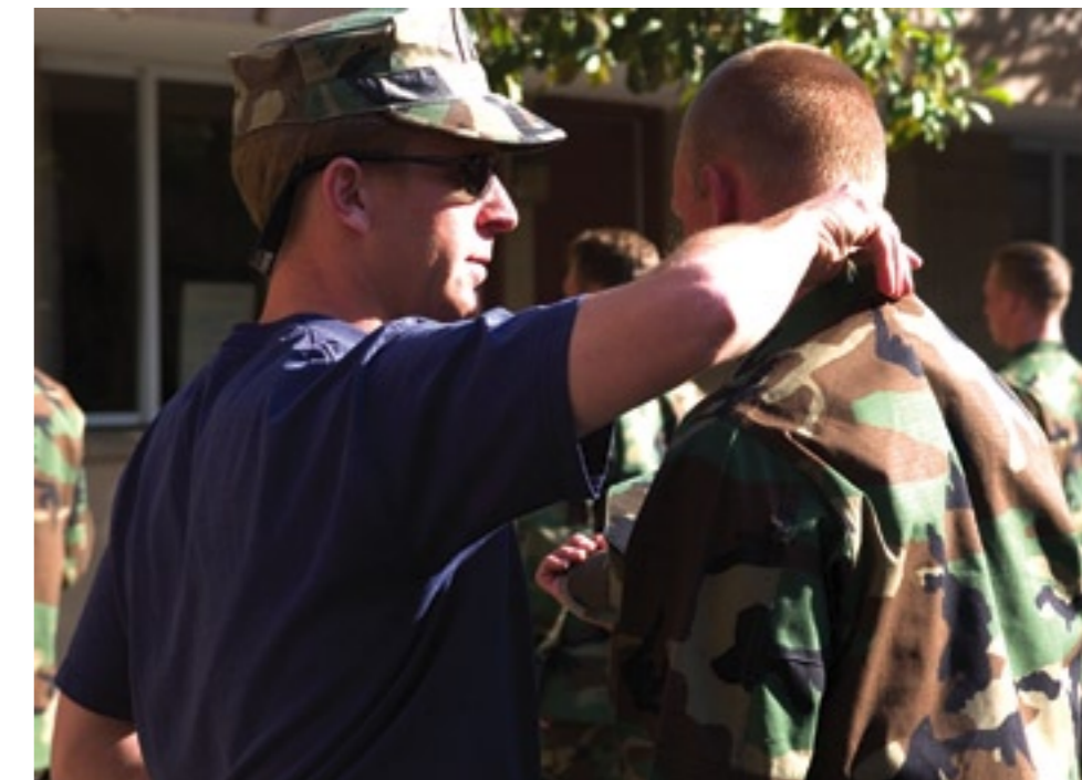
Just as soon as Indoc gets started, students discover they've already failed. A wrinkled collar or a few stray grains of sand are infractions that invariably result in a beat-down: sets of pushups, trips to the surf, and eight-count body builders.