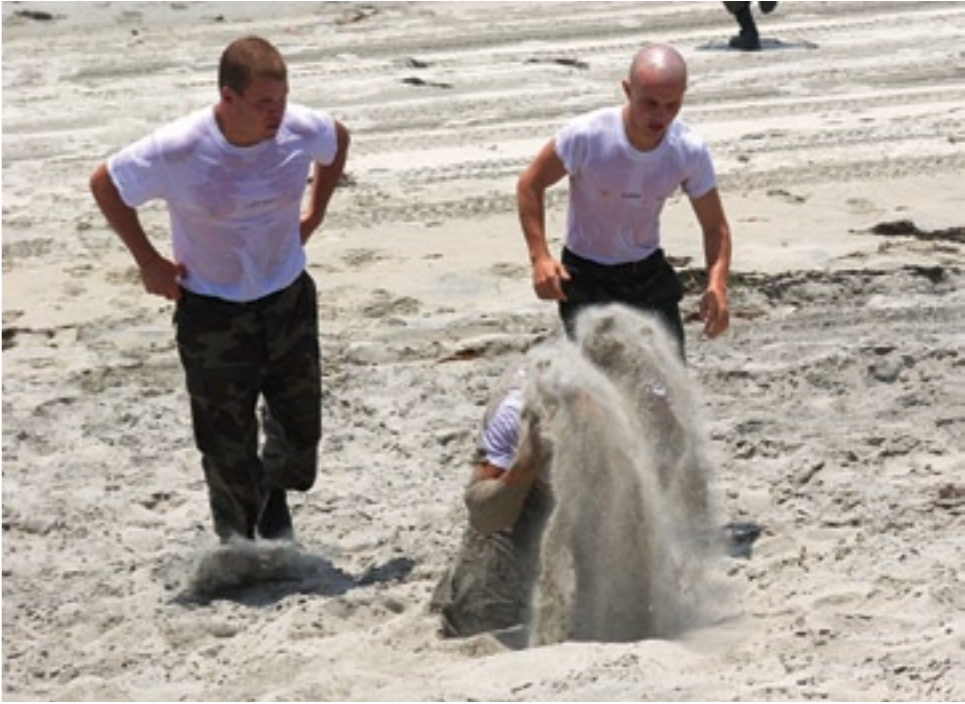
Submerge in 60-degree ocean water, dowse with sand, don't rinse, and repeat: This cycle will continue every day until the end of First Phase, but for now, it's a novel experience.