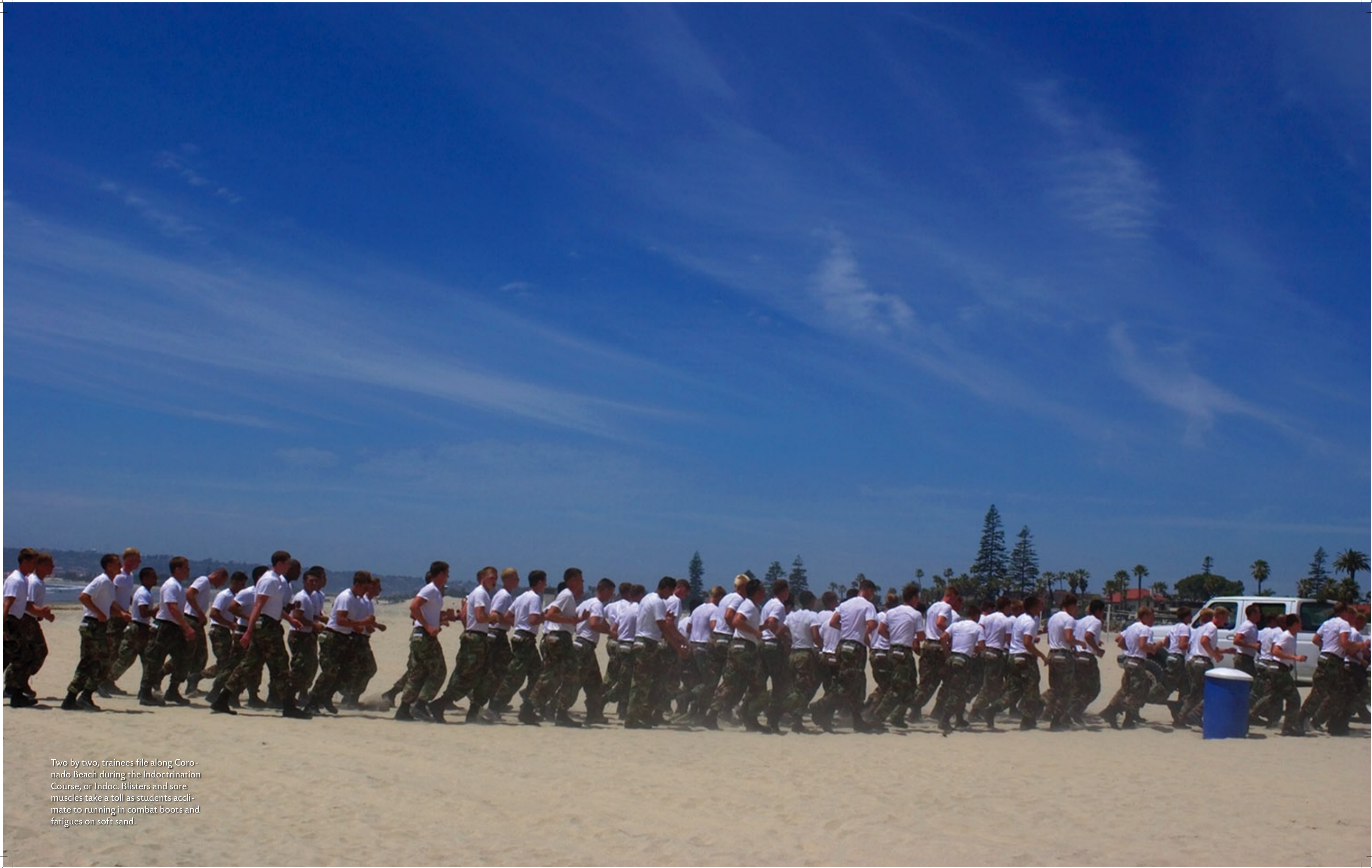
Two by two, trainees file along Coronado Beach during the Indoctrination Course, or Indoc. Blisters and sore muscles take a toll as students acclimate to running in combat boots and fatigues on soft sand.