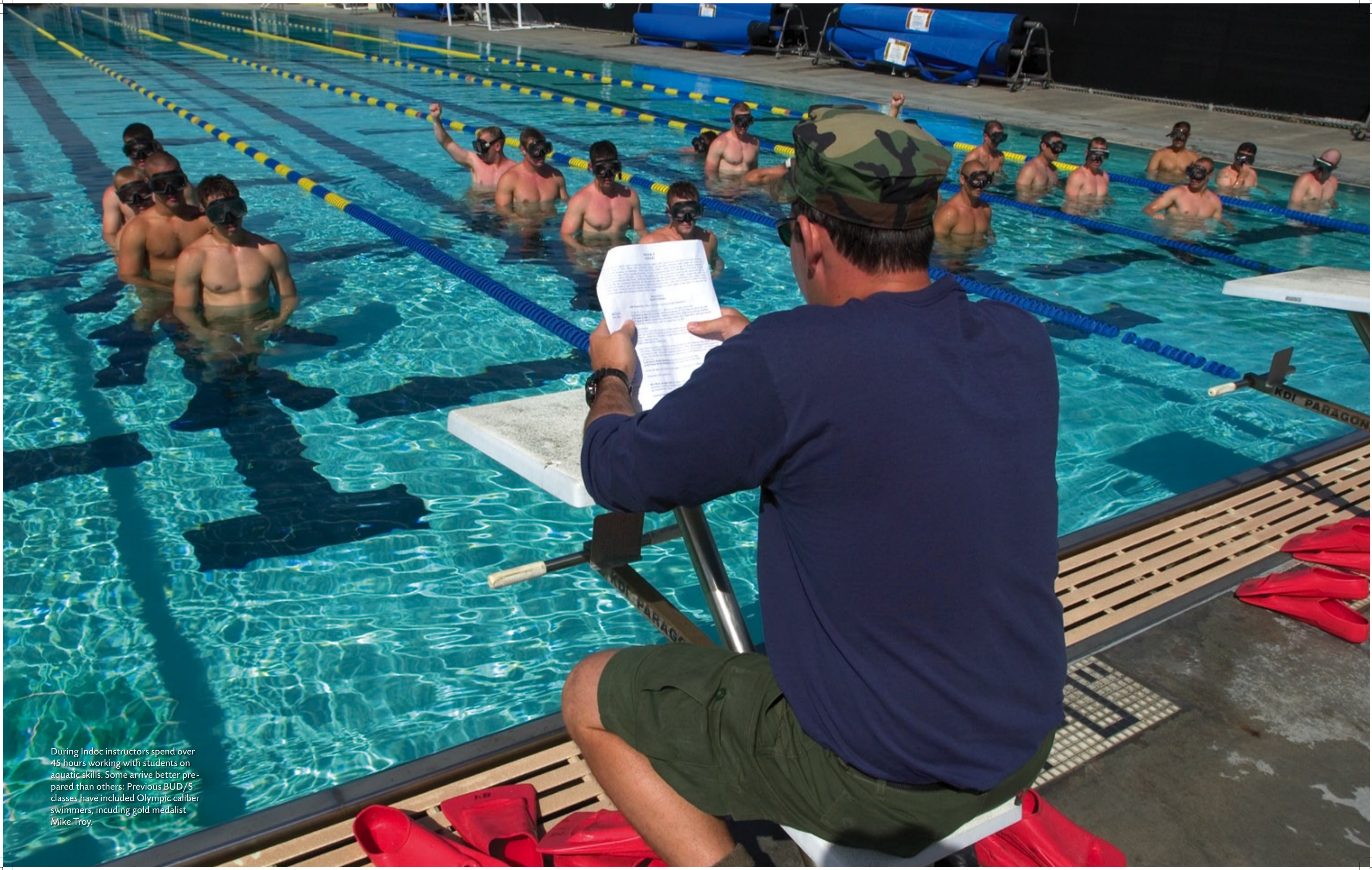
During Indoc instructors spend over 45 hours working with students on aquatic skills. Some arrive better prepared than others: Previous BUD/S classes have included Olympic caliber swimmers, including gold medalist Mike Troy.