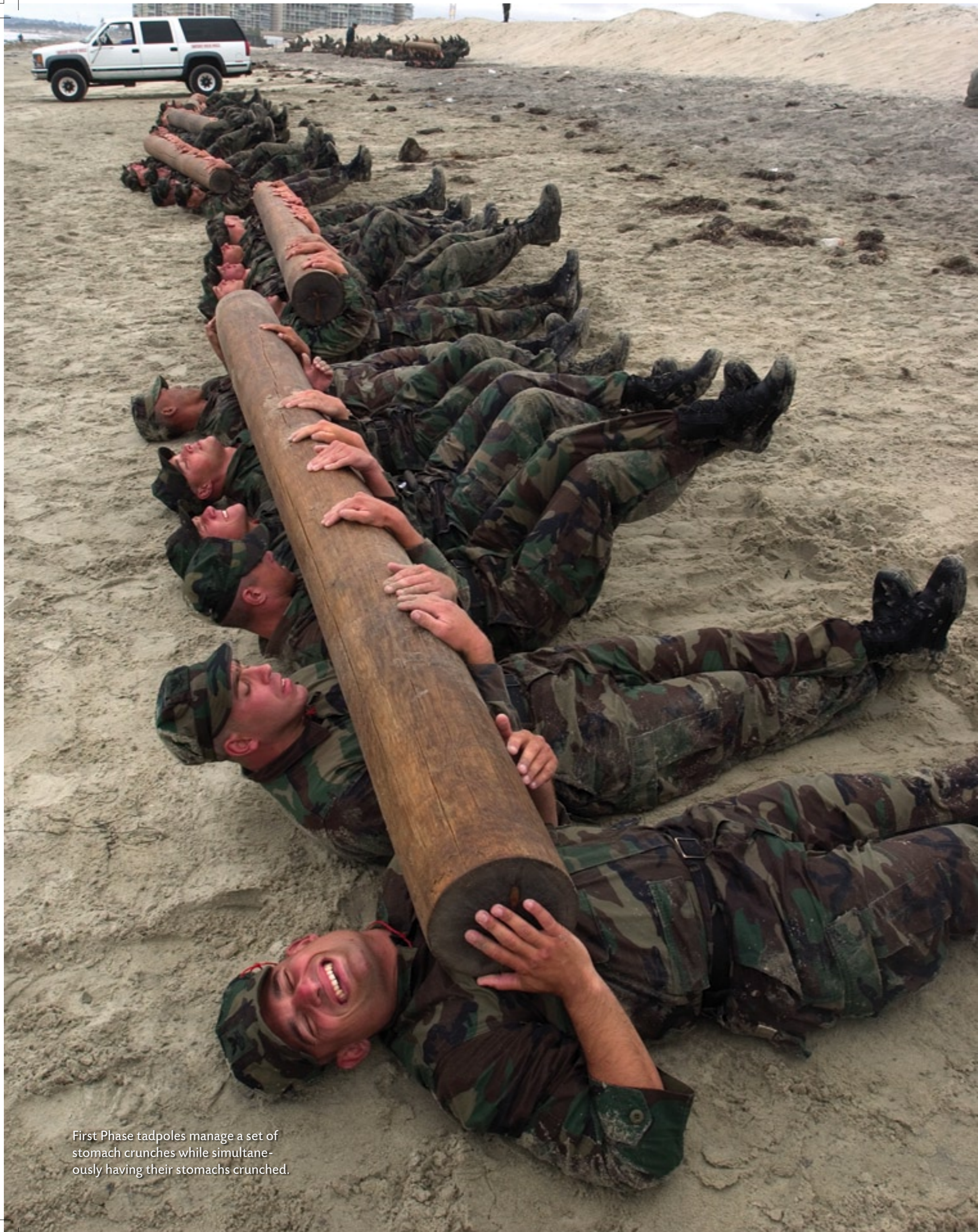
First Phase tadpoles manage a set of stomach crunches while simultaneously having their stomachs crunched.