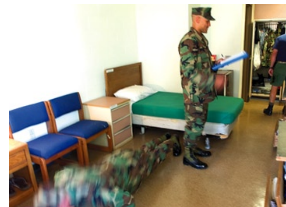
During barracks inspection instructors seize the opportunity to snoop through students' belongings. Here, instructors chance upon some Barbie Doll-themed cookies in a trainee's closet. For the rest of the day the student will have to carry his Barbie snacks with him through training exercises (or evolutions as they're known in BUD/S), to the delight of his fellow enlistees.